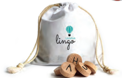
1 bag with lettered playing tiles

Do you want to torment your brain cells, develop the imagination, expand your vocabulary, connect contexts to fulfil the task? Welcome to Lingolandia. The game is intended for two to eight players of all ages who want more from a game. Based on natural competition, players will improve their spelling and awareness of the first letter of each word used, expand their vocabulary not only in their mother tongue but also in a foreign language and learn to use and logically combine all the knowledge they have ever learned.