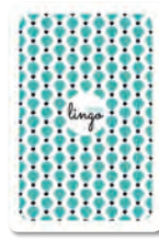
116 playing cards